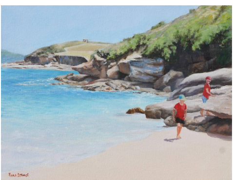
'Rock climbing boys - La Perouse' by Paula Service