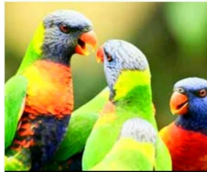
Subject Pecking order Location Tamarama

Our Graeme Bogan continues to get out there and come up with the results. Yet again he has photography in the July edition of the The Beast Magazine 2021. Well done Graeme.